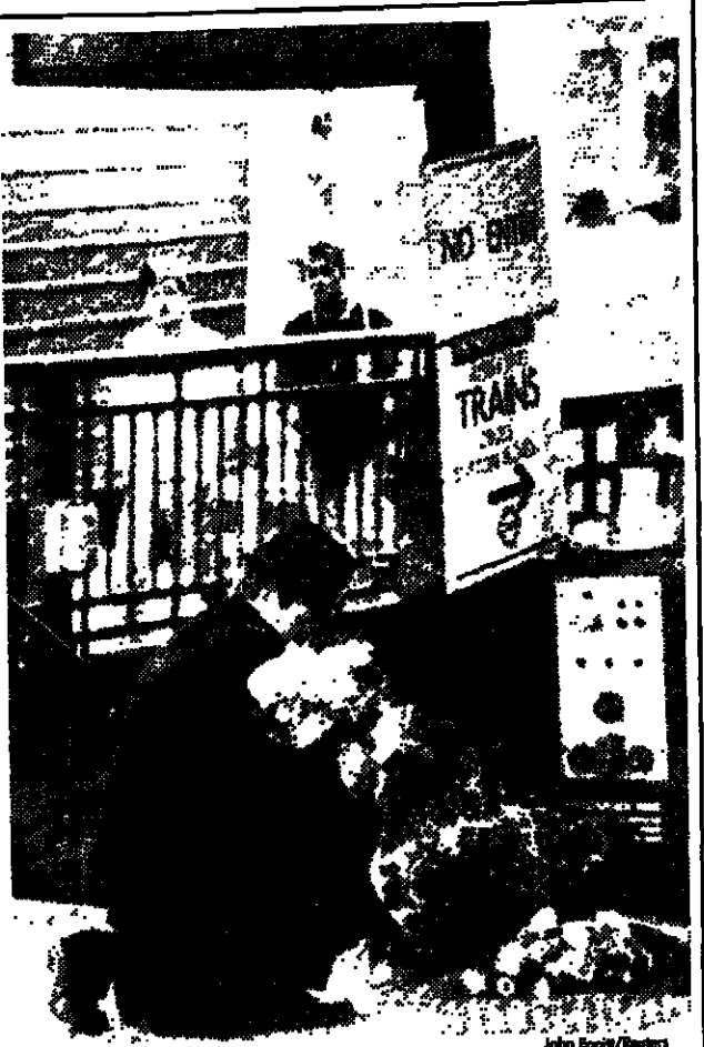
A London policeman placing memorial flowers at the entrance to the King's Cross subway station Friday.

RUSSELL BAKER IN THE NEWS WEDNESDAY AND FRIDAY. LBA NEWS AT 11:58 A.M. EST.